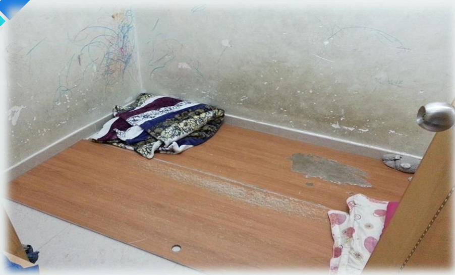
Wooden board for sleeping 棄置的木板做睡床