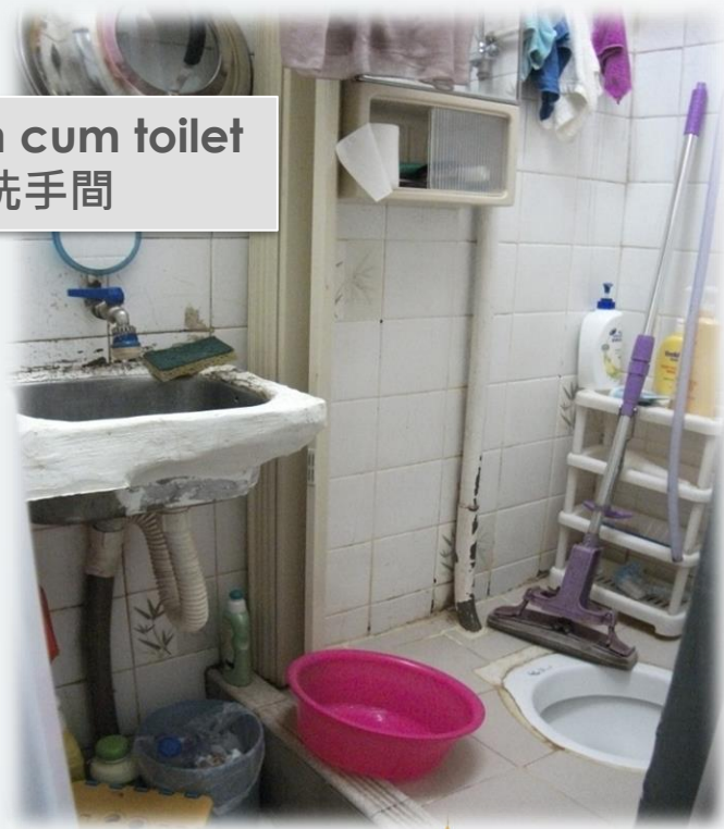
Kitchen cum toilet 廚房連洗手間