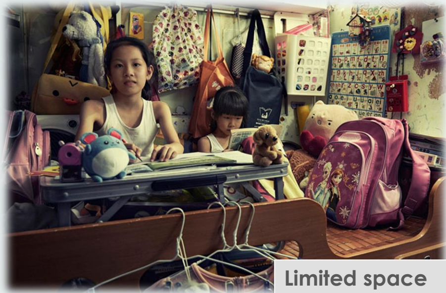
Limited space 有限活動空間