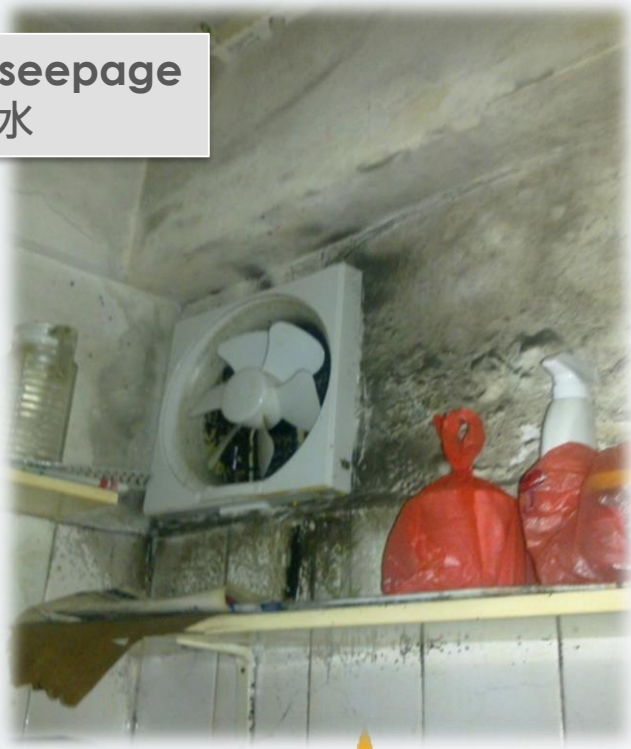
Water seepage 牆身滲水